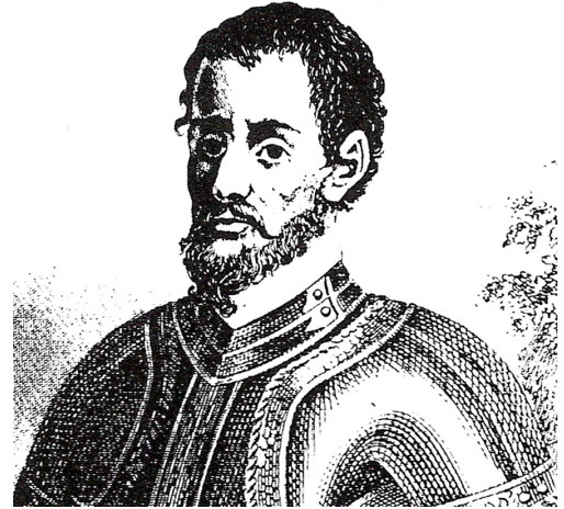
Engraving of Hernando de Soto. This engraving was done in the 1700s.

In 1539, Hernando de Soto and 600 men landed at Tampa Bay, Florida to explore the interior of North America. The coast had been explored by others including Ponce de Leon, but the interior remained unexplored.