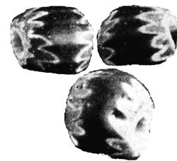
Beads like these chevron type are found in many sites visited by Hernando de Soto.

In October of 1539 the De Soto expedition established their winter camp at the town of Anhaica, an abandoned Apalachee Indian village (present-day Tallahassee, Florida). Here Spaniards would celebrate the first Christmas in the interior of the Southeast. Based on accounts and research by historians and archaeologists, it was not a "happy holiday." The Apalachee people were not pleased with the Spaniards presence and denied them food. The Spaniards at Anhaica were under siege—the Natives tried to burn the camp and the Spaniards did not leave the camp unarmed or alone.