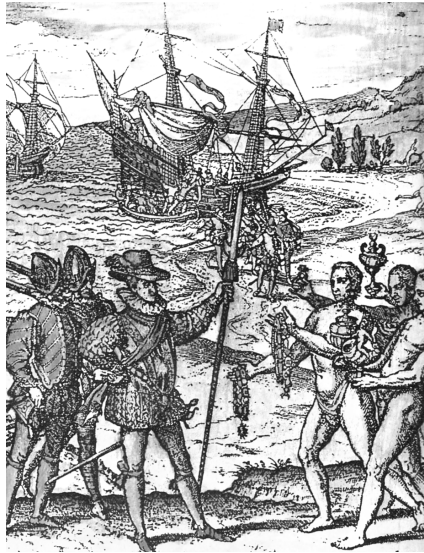
DeBry engraving of Columbus trading with the natives.