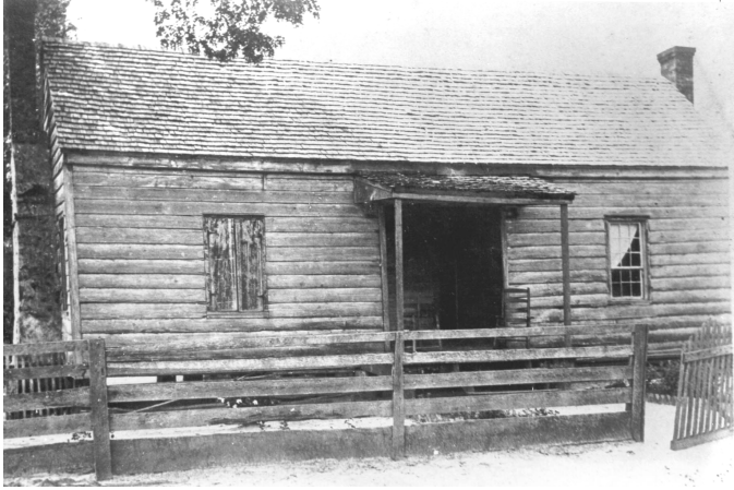
Sion Hall's log home was used as the first Lowndes County Courthouse.

Each county has a town where the government offices are located. Lowndes County's first place of government was in Franklinville in 1825. Some stories say that before the county seat was established that county business was conducted at the home of Sion Hall on the Coffee Road.