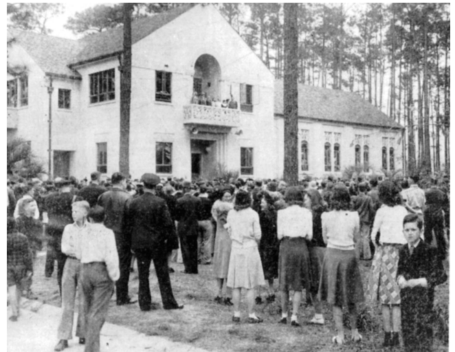
A new library building was dedicated in 1941. Eleanor Roosevelt spoke from the balcony.

The school remained a woman's college through the 1940s. Some men were permitted to attend because Emory Junior College closed during World War II, but by 1950, the school was coed and was renamed Valdosta State College.