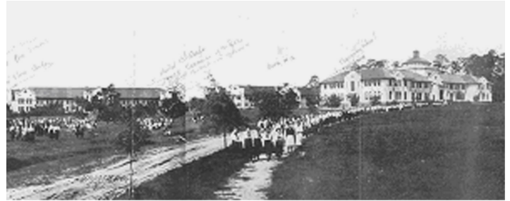
As the school grew, new buildings were added for classrooms and dormitories.

The school grew steadily, a Bachelors degree was added, and the school was renamed Georgia State Womans College in 1922.