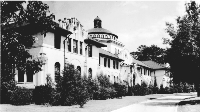
West Hall, named for Col. William S. West, opened in 1917. The building serves as Valdosta State University's centerpiece and administration building.

In 1906, the State of Georgia needed teachers. The legislature approved a new college to educate teachers and decided Valdosta was a good place to build a school. They worked on the plan and finally came up with the money to start a teacher's college which opened in 1913. The school started as South Georgia State Normal College and it was exclusively for women and specialized in educating teachers. The enrollment was small and many thought it would not survive.