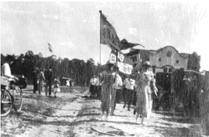
Future teachers on parade.

Subjects taught were those deemed proper to the higher education of young women—History, Literature, Mathematics, the Languages, the Sciences, Art, Home Economics, Physical Education, Music, and Vocal Expression. Teachers had to know a bit of everything!